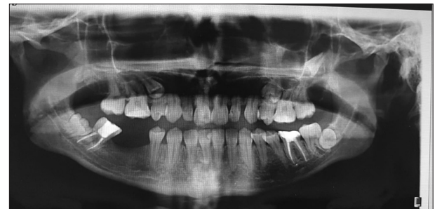
Figure 2: Post-operative orthopantomogram shows that left maxillary third impacted tooth has been displaced superiorly after surgical extraction attempt under local anesthesia