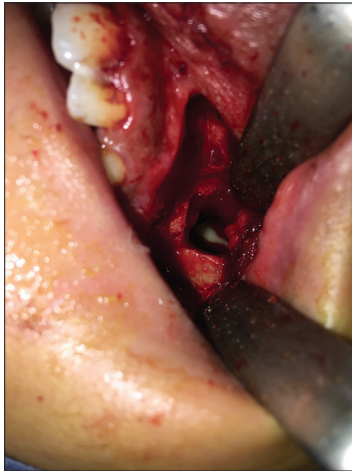
Figure 4: Caldwell-Luc approach done showing the presence of tooth in the left maxillary sinus