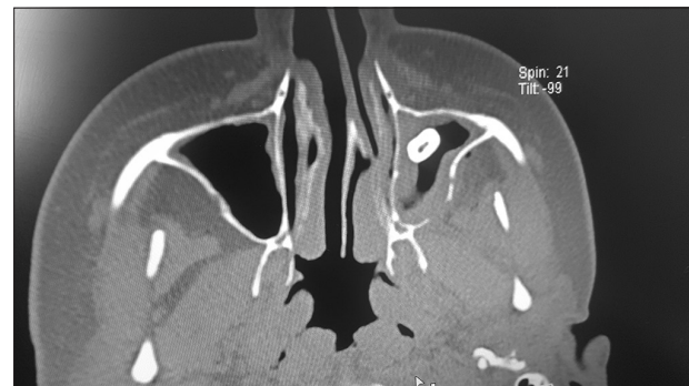
Figure 3: Axial view of computed tomography scan showing that tooth has been displaced in left maxillary sinus

to extract when they are impacted and placed superiorly, due to their anatomical relationship between the floor of the maxillary sinus, maxillary tuberosity, and infratemporal fossa. [9] As per