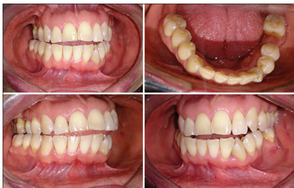
Figure 2: Panel of intraoral photographs, without volume increase or apparent pathological data