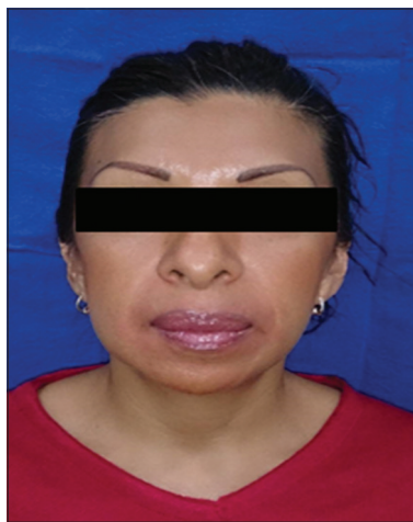
Figure 1: Clinical photograph, 47-year-old female patient, without extraoral volume increase

relation to the crown of tooth (ectopic molar), which is located apically of the lower left second molar, above the ipsilateral lower dental canal, also two periapical radiolucent images are observed in relation to the right and left lower premolars; it is suggested to perform treatment of the lower premolar ducts, an incisional biopsy is performed under local anesthesia, reporting heterogeneous cystic tissue with thickening, so a pre-surgical protocol is performed to perform enucleation and dental extractions of the left lower second molar and the low ectopic tooth. General anesthesia, a procedure that is carried out without complications, the pathological sample is sent to a histological study [Figure 4] reporting: In the histological sections with H&E staining with ×100 magnification, non-keratinized stratified squamous epithelium bands with 4-6 layers cells, with mucosa in some areas, covered with dense fibrous connective tissue well